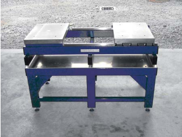
Table for Stack-Mold Systems with fixed center-piece

Base-platform underneath table (optional extra)